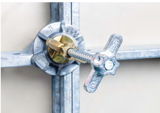
► The RASTO® anchor for single-sided anchoring

Robust galvanised steel frame reduces the need for repairs and increases the service life of the panel elements