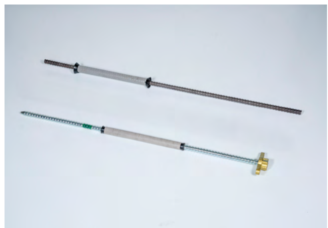
► Flexible anchor selection possible. In this case, RASTO® anchor for single-sided and DW 15 anchor for double-sided anchoring