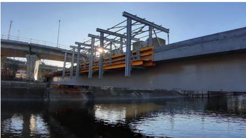
► Anchoring to the structure not required

High level of occupational safety by using PROTECTO or MODEX side protection