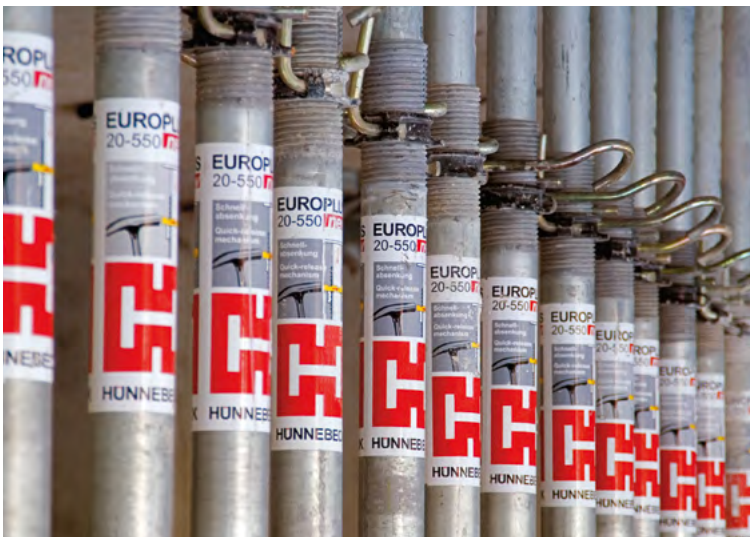
► High service life as a result of the seamless hot-dip galvanisation on the inside and outside of the tubes