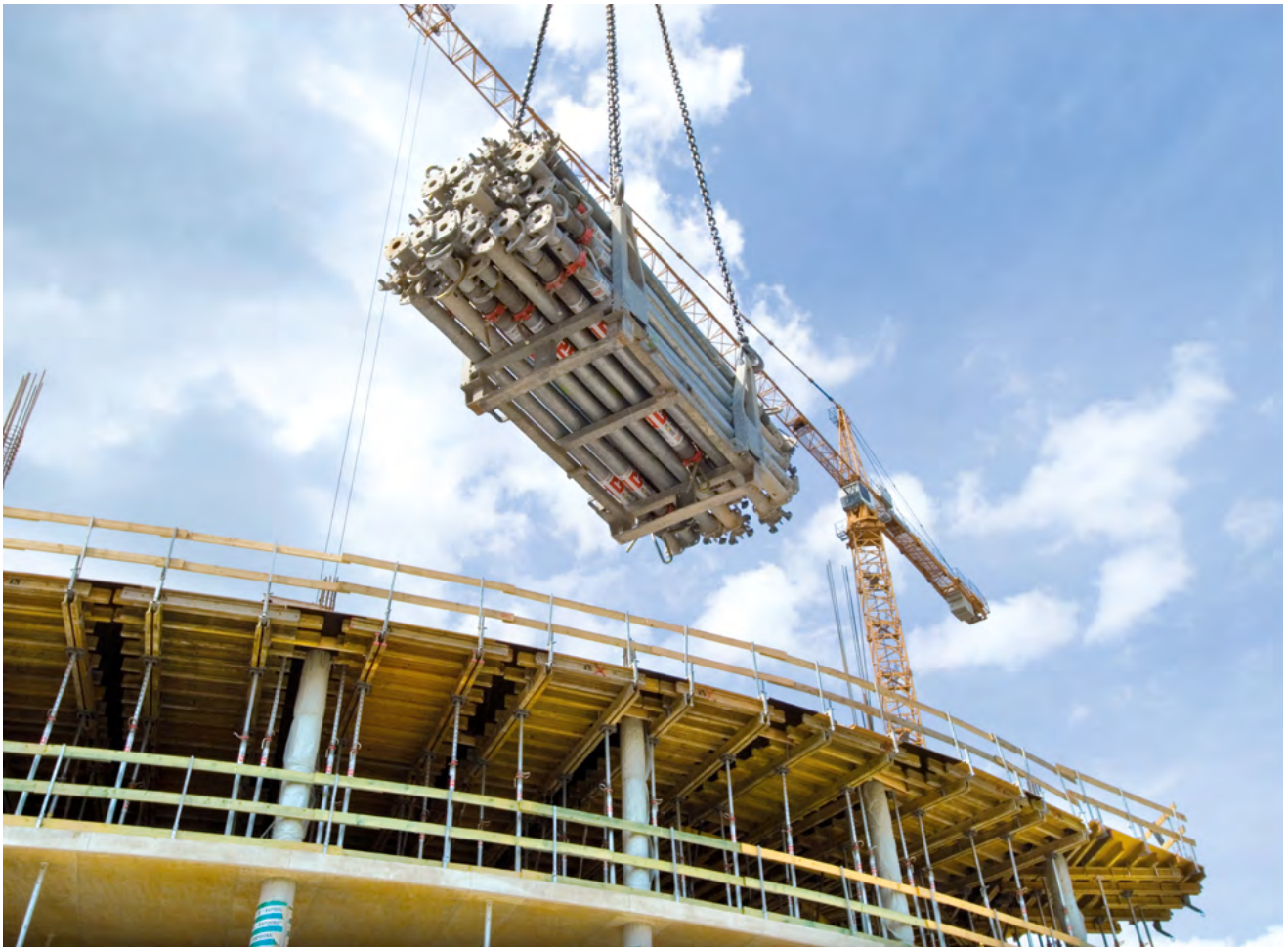
► Safe transportation of props in stacking frame