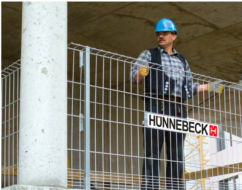
▶ Very economic as a result of the low erection and dismantling times