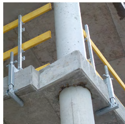
► Versatile modular system composed of just a few robust basic components