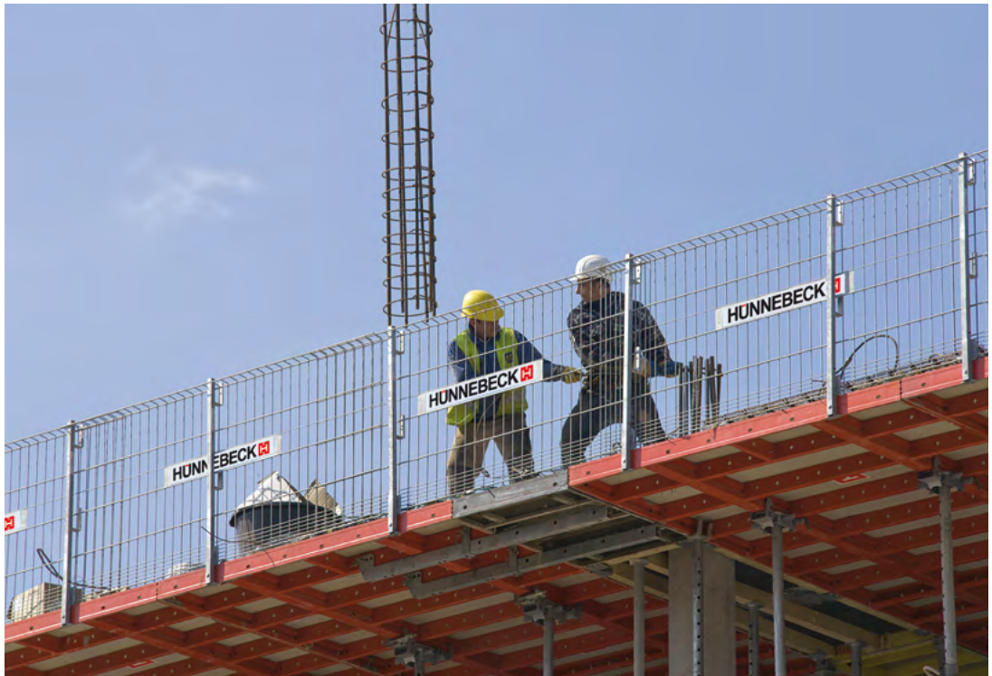
▶ PROTECTO is compatible with all Hünnebeck slab formwork systems, such as TOPMAX as shown here