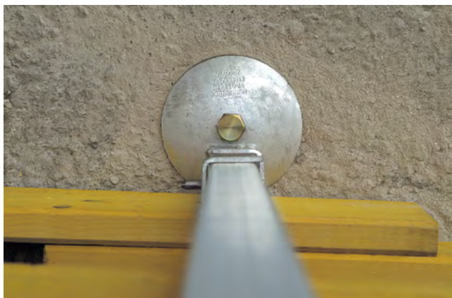
► Screw base joint can easily be fixed to the base slab

Highly durable and robust system parts due to the complete galvanization of all steel components